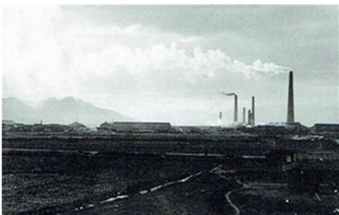
Photo 4 The actual state of smoke injury

(Source)Niihama City Hirose Memorial Museum (2007) page18