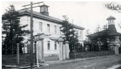
Gunze Yarn head office

Hatano sympathized with Maeda's philosophy of nurturing industry by setting the county policy (named in Japanese “Gunze”). The term Gunze later became the company name of Gunze Yarn. The company name included the meaning of bringing together the power of local people and aiming for the development of local communities.