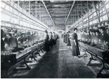
Inside Gunze Yarn Factory

strong yarn." Thus, he thought that the improvement of morals and motivations of female workers were indispensable for the quality improvement of products.